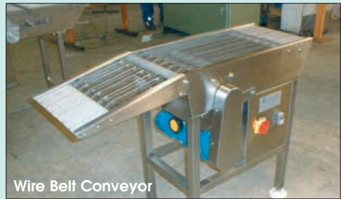
Wire Belt Conveyor