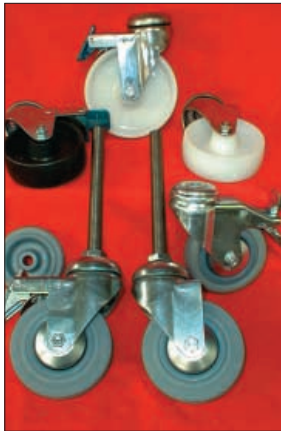
Wheels & Castors