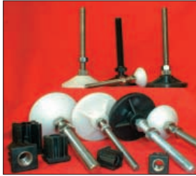
Adjustable Feet & Thread