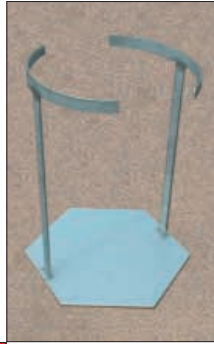
PVC waste bag holder