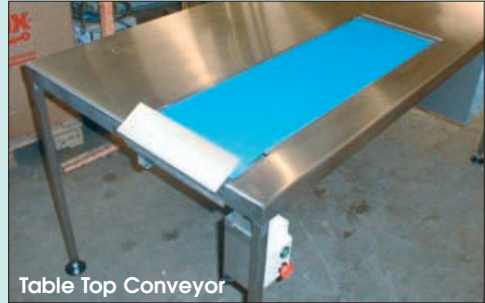
Table Top Conveyor